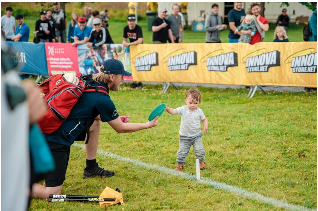
Disc Retrieval at the European Open in Nokia, Finland

Countries interested in becoming PDGA affiliated should contact the International Director for more information.