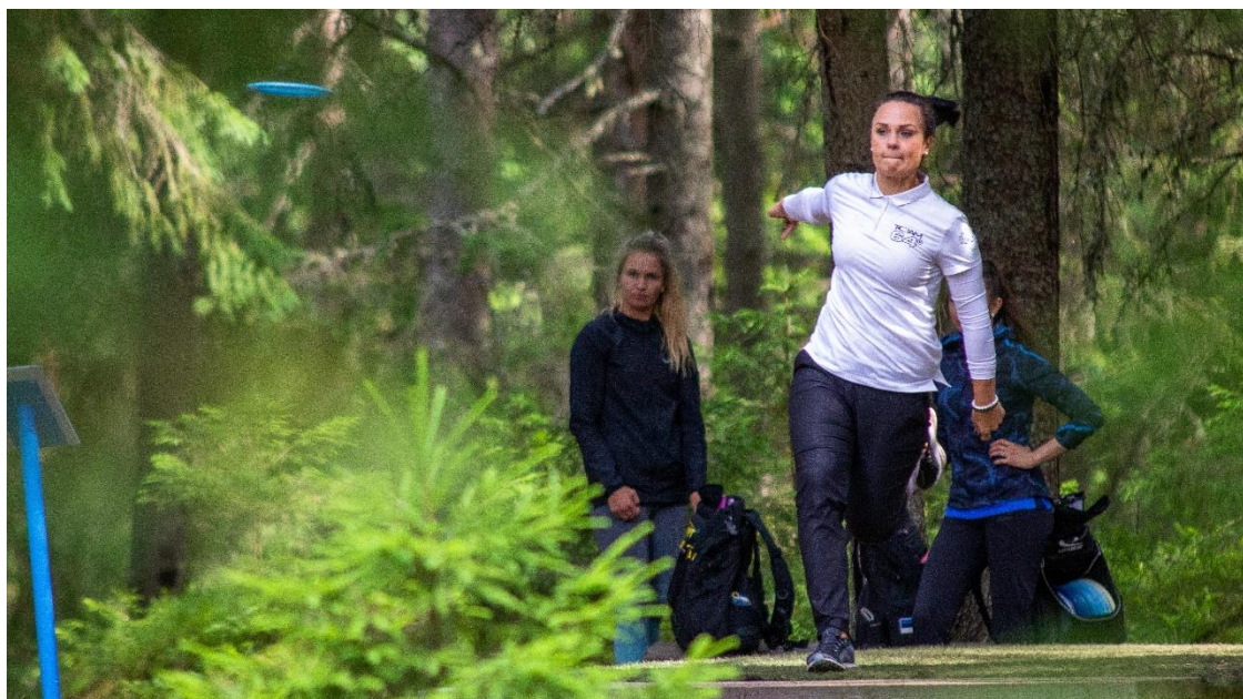
Estonia's Kristin Tattar won the 2019 United States Women's Championship