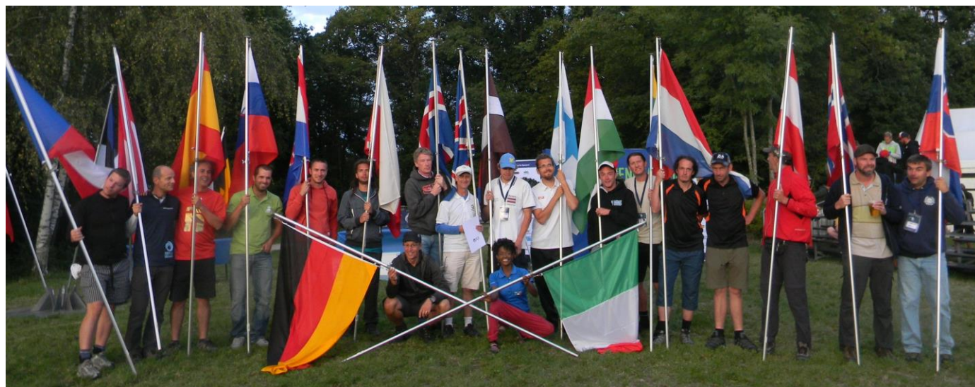
PDGA Europe Country Coordinators