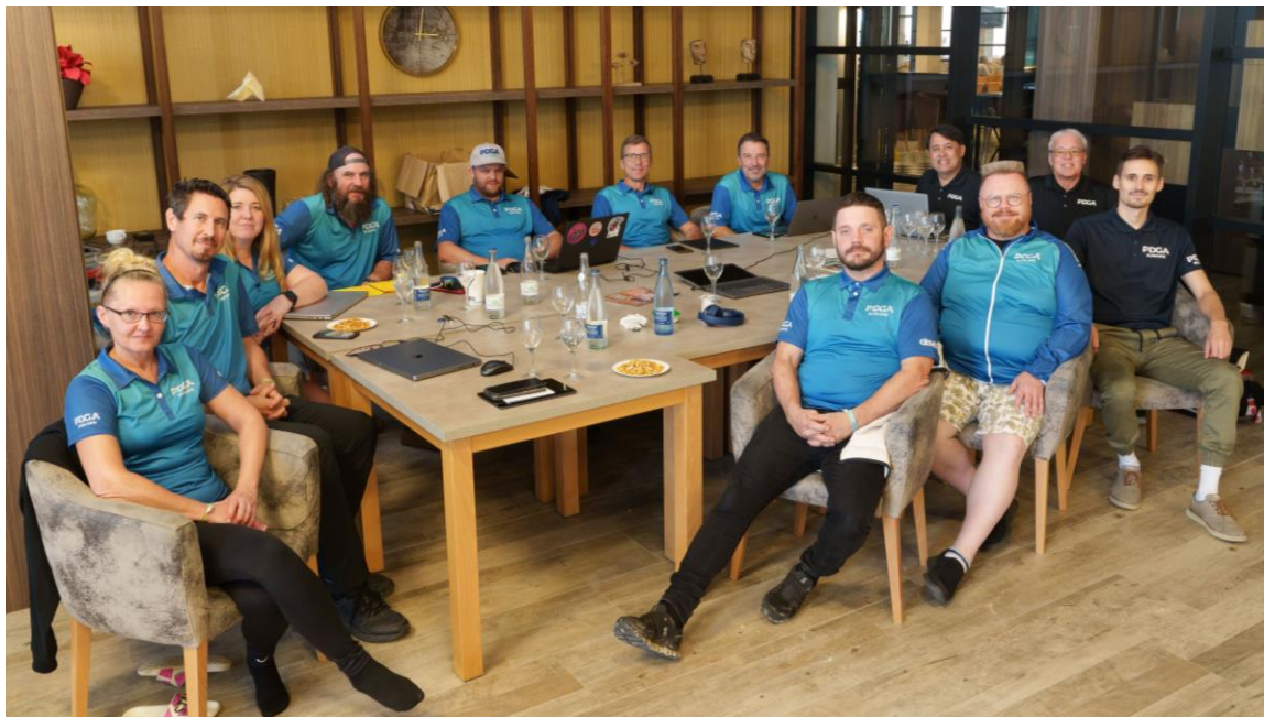
PDGA Europe Summit Attendees, Costa Ballena, Spain, October 2023.