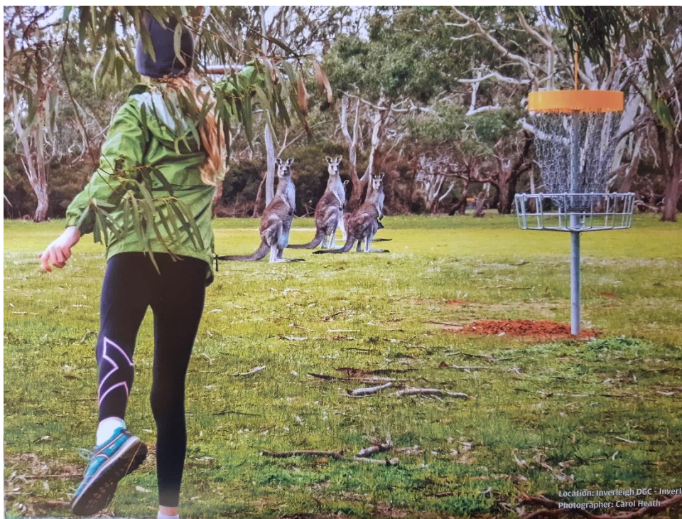
Kangaroos study the basics of putting at Australia's Inverleigh course

Countries interested in becoming PDGA affiliated should contact the International Director for more information.