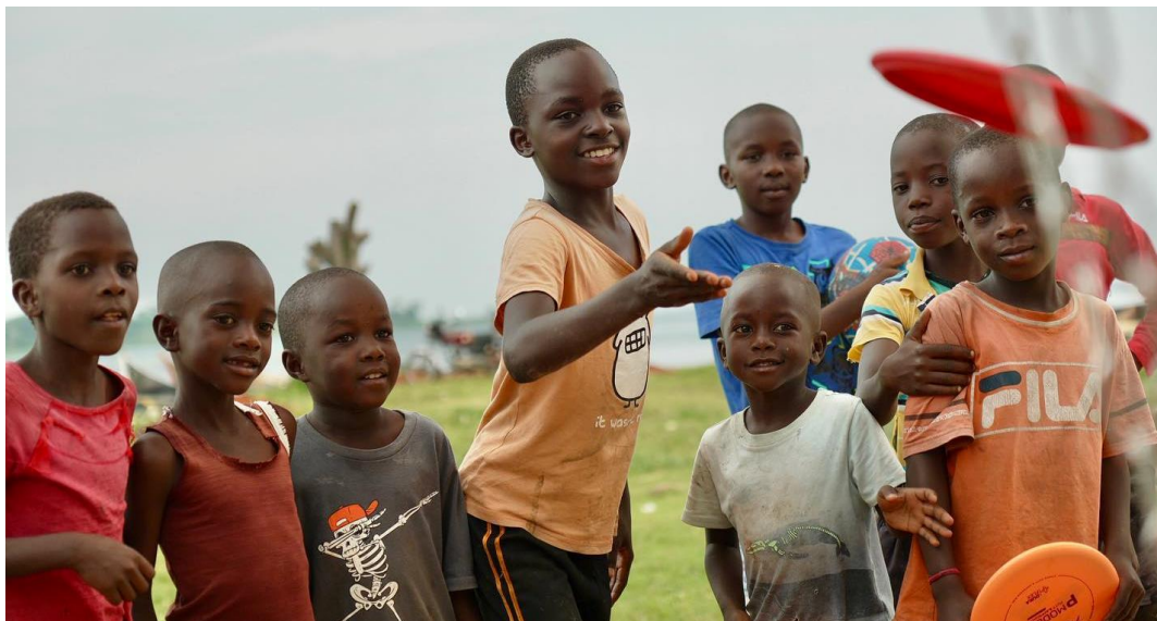
Beneficiaries of the Paul McBeth Foundation Project in Katosi, Uganda, supported by PDGA

For more info on the PDGA Disciplinary procedures see: https://www.pdga.com/documents/disciplinary-process