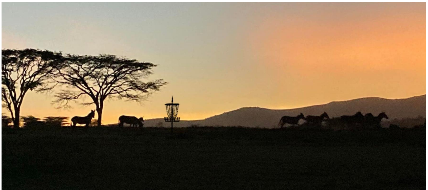
Sunset over the Rimpa Wildlife Conservancy near Nairobi, Kenya