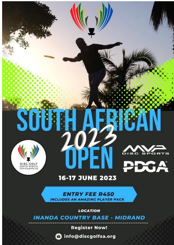
PDGA Events Promotion around the World