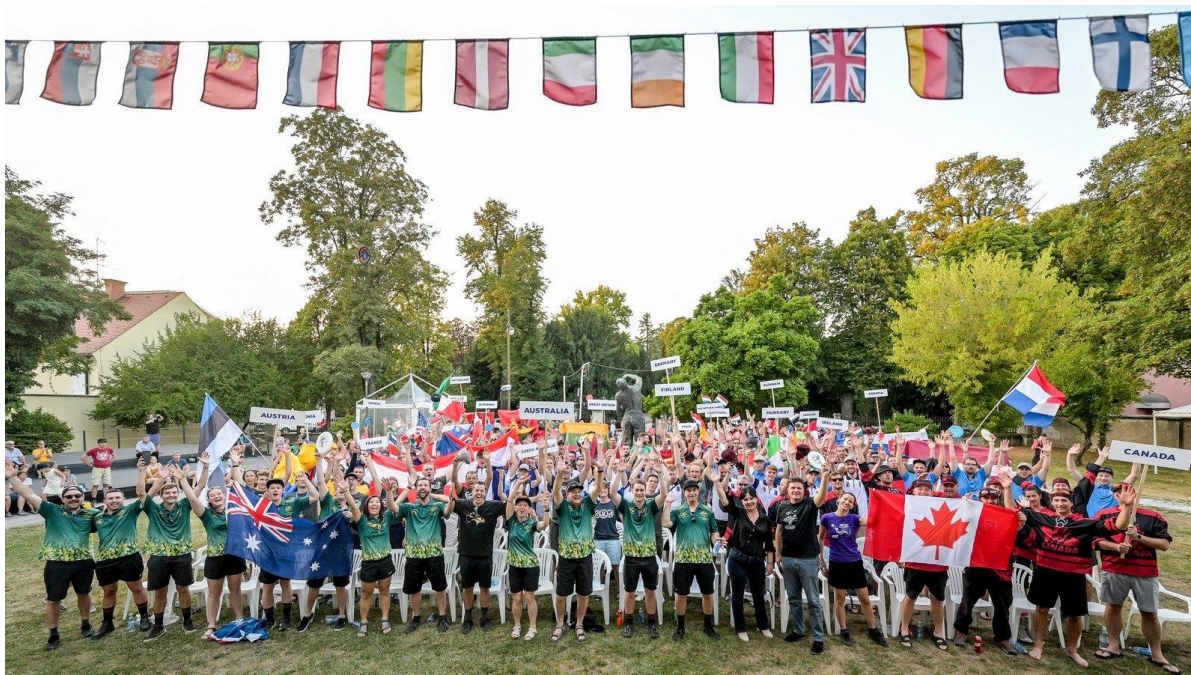
2022 WFDF World Team Championships Participants

The PDGA supports International Major events, the European Championships and the WFDF Team World Championships with financial sponsorship, social media promotion, live scoring and on-site presence.