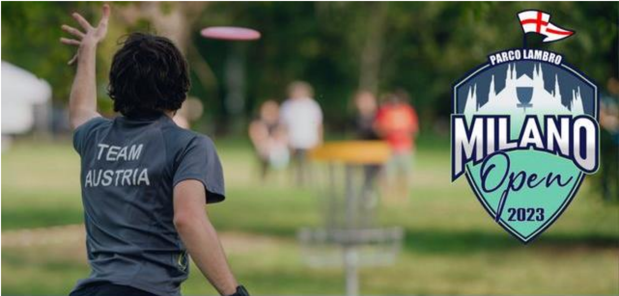
The Parco Lambro course in Milan was extended from 12 to 18 holes thanks to a PDGA Europe Grant