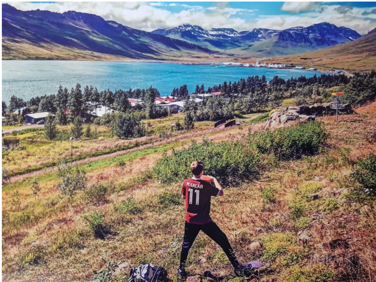
Iceland's scenic Neskaupstadur Course

All other issues: The International Director at international@pdga.com .