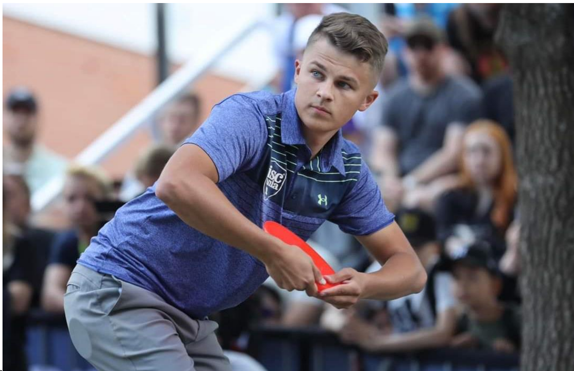
Finland's Niklas Anttila is Europe's top rated male player