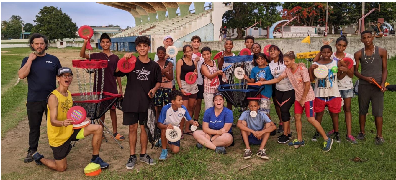
Marco Polo Program in action: Introducing the game in Cuba

For more information on the Marco Polo Program, including the Application Form and examples of Project Reports from recipients to date please see: http://www.pdga.com/marco-polo-program .