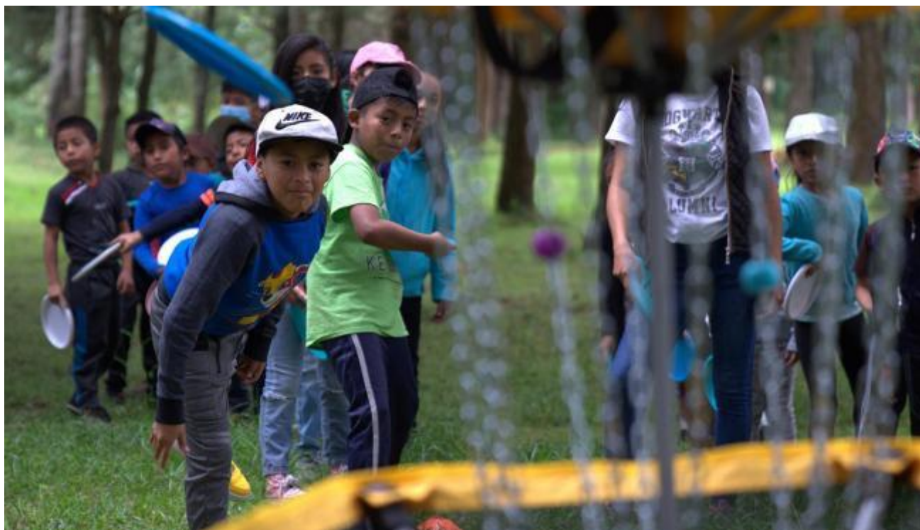
Learning to play in Guatemala

3 Object targets are allowed under XB and XC Tier events but this must be specified when filing the sanctioning agreement.