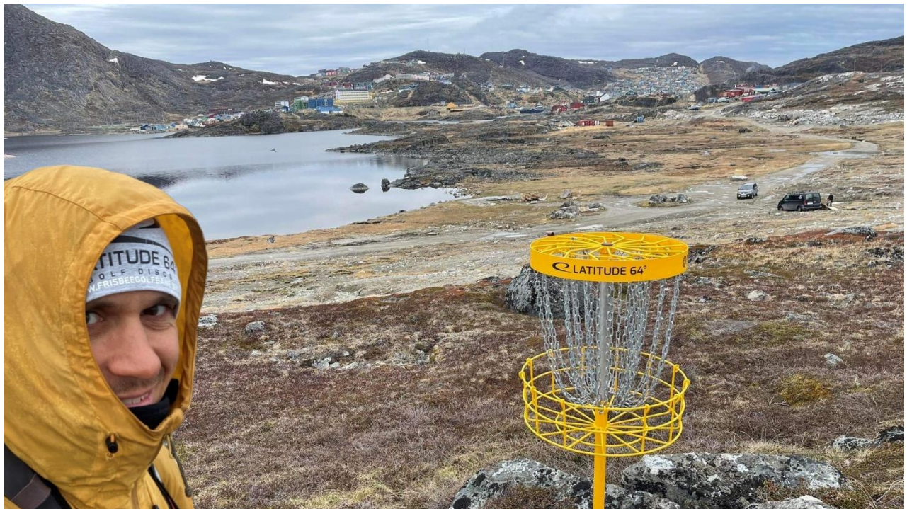
In 2023 Denmark's Martin Spliid & Latitude 64 organized the 1 st course installations in Greenland