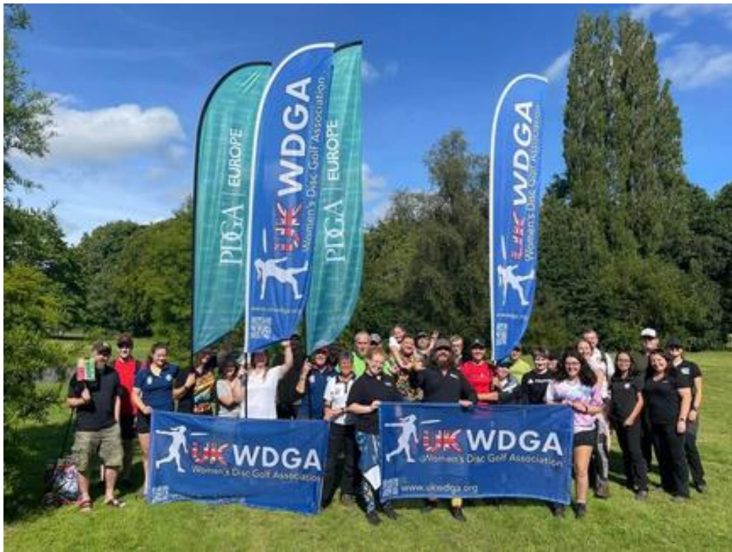
The UK Women's DG Association was another recipient of a PDGA Europe Grant in 2022-23