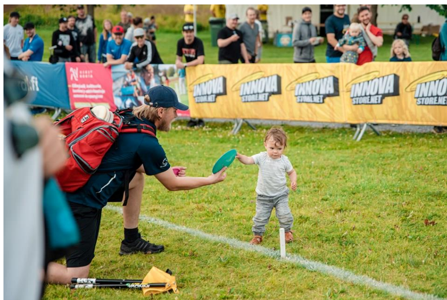
Disc Retrieval at the European Open in Nokia, Finland

Join the PDGA. The professional association for ALL disc golfers!